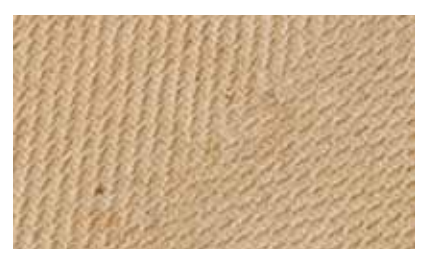
The unique surface finish of STEICOtop

In addition, STEICOtop insulating boards are diffusion 'open'. Should moisture penetrate the board, it can easily evaporate, without damage to the board.