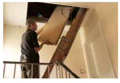
The STEICOtop boards are light in weight and due to their size of 1200 x 400 mm can be easily fitted through most loft accesses.

Many buildings have been designed with accessible, but not habitable attic spaces. Many households utilise this space for additional storage, by laying boards over the insulated joists. With the introduction of better insulation/energy efficiency requirements, deeper loft insulation is now required.